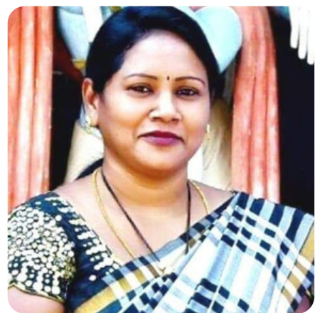
D KOTESWARAMMA NURSING FACULTY, PATNA MEMBERSHIP DIVERSITY COMMITTEE