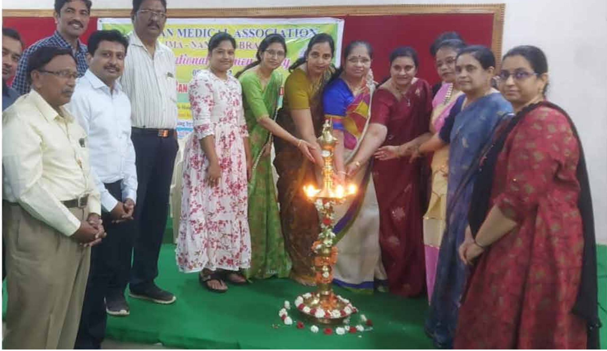
IMA Nandyal Branch. COLS program.