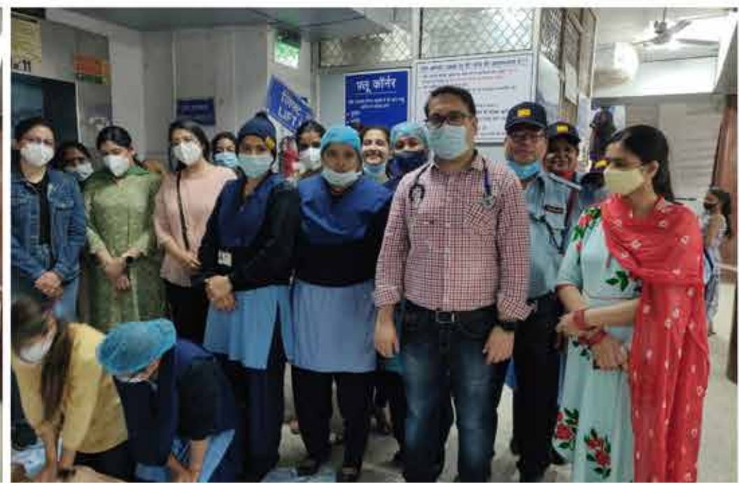
ABVIMS & Dr. RML Hospital, Delhi. COLS program