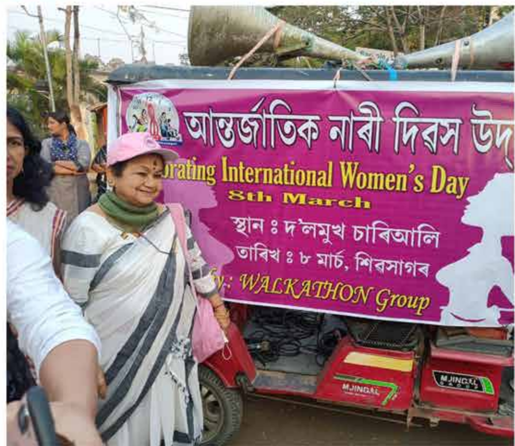
Celebrations, Lady Anaesthesiologists, Udaipur.