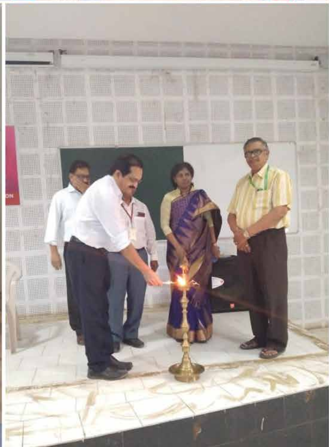
IMA Odisha State Branch. COLS program