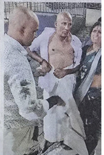
సీపీఆర్ అనంతరం కోలుకున్న భక్తుడు